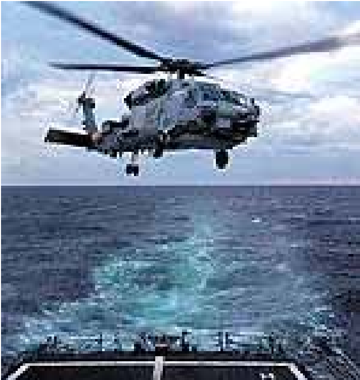
MH 60 R

On 25 February, the Minister for Defence, Senator John Faulkner, announced that the Government has given first pass approval for a major project to provide the Australian Defence Force with a new naval combat helicopter.