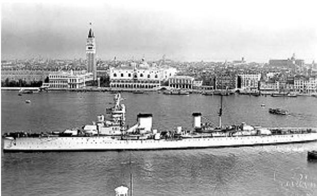
Bartolomeo Colleoni at Venice

To the two Italian cruisers the four destroyers must have looked easy game. The cruisers had not only the advantage of weight and range of gunfire, they also had a margin of some knots speed over the