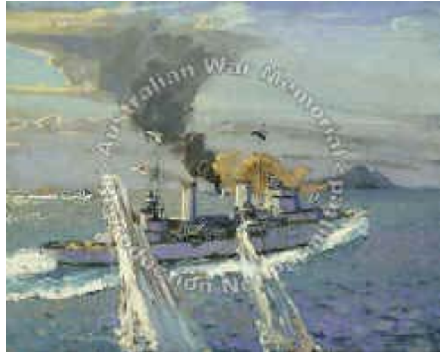
HMAS Sydney off Cape Spada