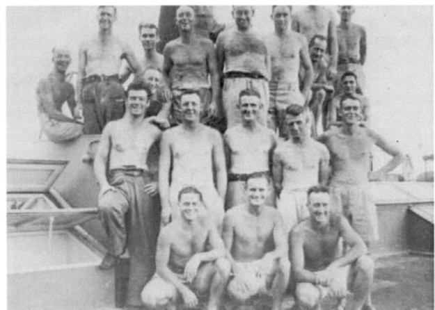
Crew members from HMAS Whang Pu circa 1944