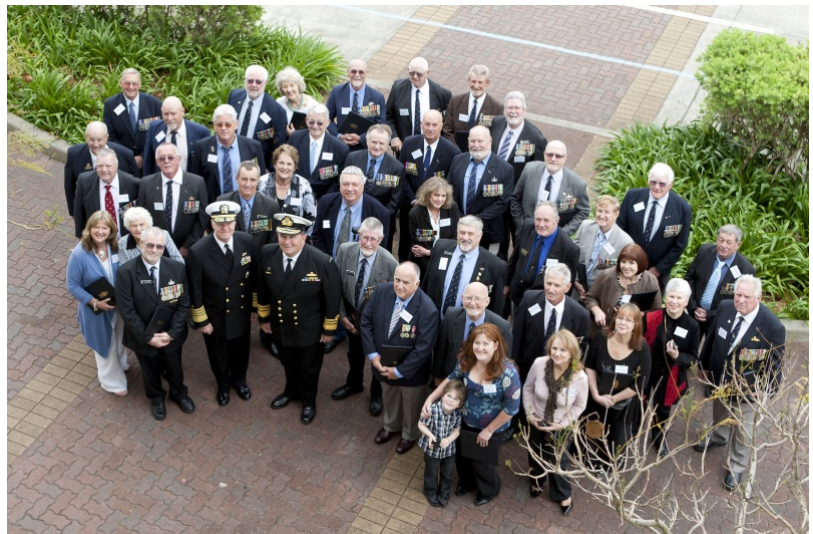
CN and CNO with award recipients at HMAS Waterhen on 1 October 2010

Vice Admiral Crane concluded, "These men have received a rare honour from the United States Navy for conducting their explosive ordnance disposal duties with exceptional professional competence, disregard for their own safety and an unwavering devotion to duty. This sets the standard for not only our current Navy Clearance Divers, but for all those serving in today's Royal Australian Navy."