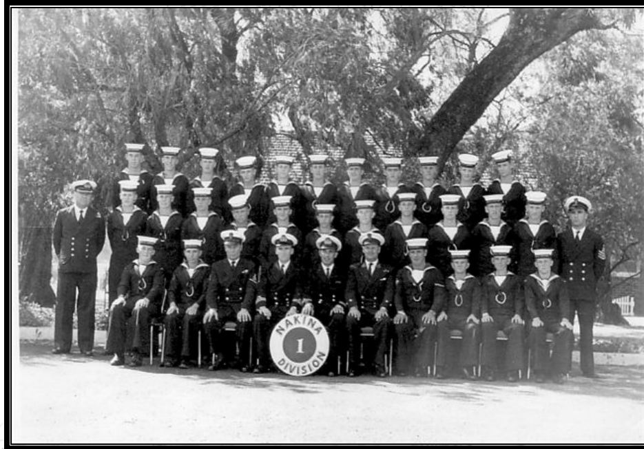
Nakina Division 1962