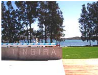
HMAS Tingira Reserve

The council has made a lot of effort to maintain the historical importance of HMAS Tingira and to that extent it has established a memorial in Tingira Reserve at Rose Bay. The Tingira Reserve was established in 1962 and in later years a memorial to HMAS Tingira was established with the assistance of the Council, DVA and the local RSL.