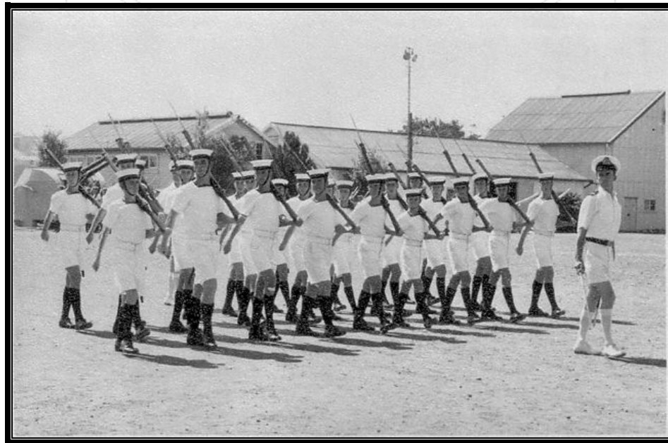
Nakina Division 1962 (Note the 303 Rifles and the dreaded red gravel surface of the Parade Ground)