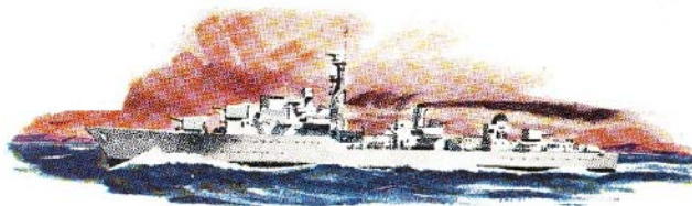
A ship of the "Daring" Class

The Junior Recruits' Training Establishment is situated on the Swan River at Fremantle, 8 miles from Perth, Western Australia.